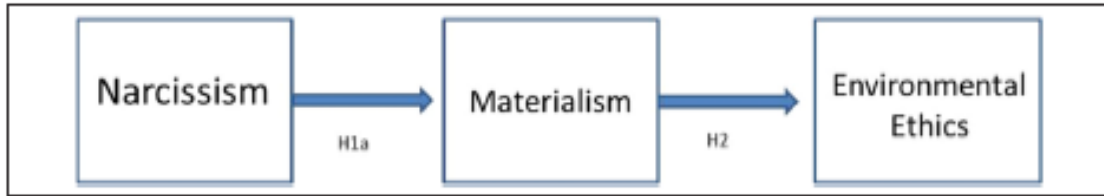
Figure 1. Narcissism, materialism, and environmental ethics results.