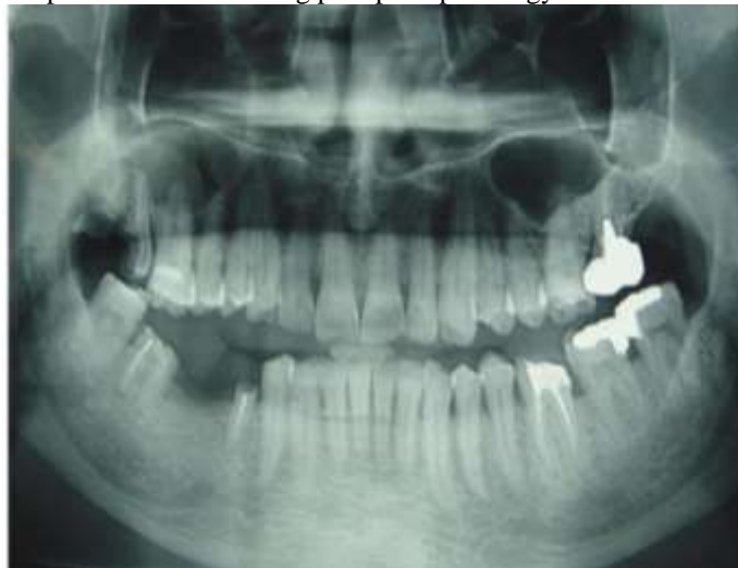
Figure 3. Postoperative OPG- After 1 week