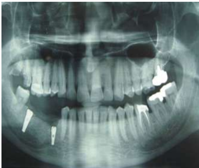
Figure 4. Postoperative OPG- After 6 week