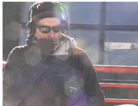
Figure 1: A mobile performer

We present a system where multiple participants can navigate about a university campus, several city blocks, or an even larger space. Equipped with position-tracking and orientation-sensing technology, their locations are relayed to other participants and to any servers that are managing the current state. With a mobile device for communication, users are able to interact with an overlaid virtual audio environment, containing a number of processing elements. The physical space thus becomes a collaborative augmented-reality environment where immersive musical interfaces can be explored. Musicians can input audio at their locations, while virtual effects processors can be scattered through the scene to transform those signals. All users, performers and audience alike, receive subjectively rendered spatial audio corresponding to their particular locations, allowing for unique experiences that are not possible in traditional music performance venues.