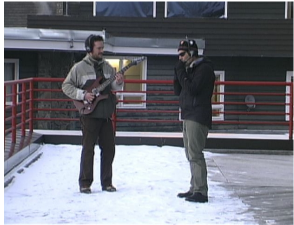
Figure 3: Two participants jamming in a virtual echo chamber, which has been arbitrarily placed on the balcony of a building at the Banff Centre.

Approaching mobile music applications from the perspective of virtual overlaid environments, allows novel paradigms of artistic practice to be realized. The virtualization of performer and audience movement allows for interaction with sound and audio processing in a spatial fashion that leads to new types of interfaces and thus, new musical experiences.