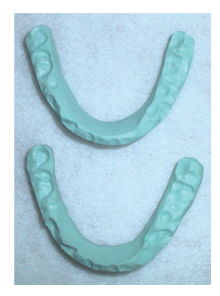
FIGURE 1: Custom-made intraoral appliance used for holistic temporomandibular therapy.

of the OA, followed by with application of the OA. Any significant change in the alignment of the occiput-atlas axis or the cervical spine was explored in relation to the OA. Examination was done within several days (maximum 3 days) after prescribing the first OA for the participant. The patients assumed a supine position facing straight ahead during the examination procedure. The degree of rotational misalignment between the atlas and the axis was measured