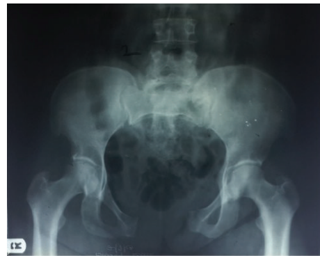
FIGURE 2: Pelvic X-Ray showing wide pubic diastasis, fractured left upper ischial ramus, and widened sacroiliac joints.

patients with a traumatic bladder rupture have an associated pelvic fracture [4].