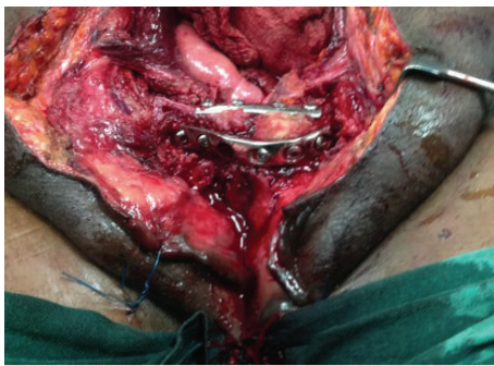
FIGURE 4: Image showing plated pelvic fracture after reduction and repair of bladder and pelvic floor.

predisposing factors to eversion and prolapse of bladder. Other reported causes of bladder eversion and prolapse in human were pulling out of Foley's catheter [12] and bladder eversion concurrent with uterine prolapse [13] and primary adenocarcinoma [14]. Trauma as a cause of bladder eversion and prolapse as seen in this case is not widely reported. We could not find in the literature search any of such occurrences secondary to severe pelvic injury. However, isolated bladder rupture or tear without prolapse is a common complication of high-energy events [15].