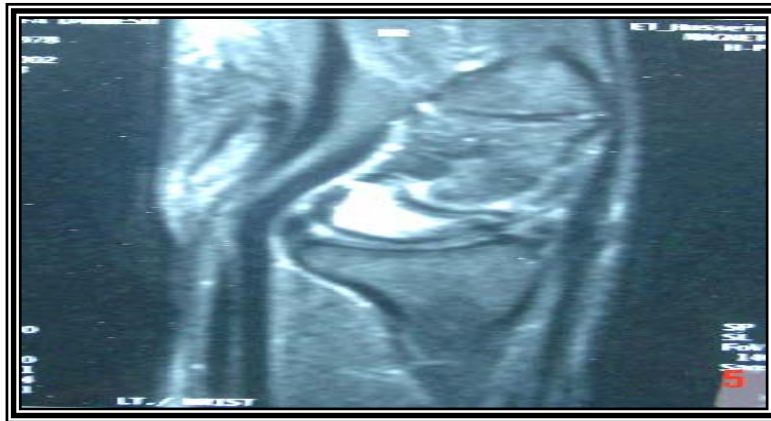
Fig. (1 b): bilateral foraminal narrowing with C.T. S.