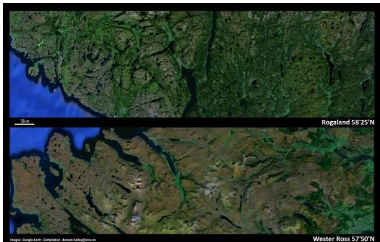
Figure 1: Satellite images of Rogaland, Norway and Wester Ross, Scotland. Dark green areas are woodland

This is almost entirely due to a steep decline in the intensity of domestic stock grazing 1 and associated human activities such as muirburn (Bryn, 2008; Bryn and DeBella-Gilo, 2011; Bryn et al. , 2013; Hofgaard et al. , 2010; Rekdal, 2010a; 2010b; Speed et al. , 2008): “Much of our rough grazing/moorland ( utmark ) has been deforested. This is now returning to forest ... around 15% of the total land area (of Norway) may be re-wooded, mostly in montane and coastal areas” (Rekdal, 2010b); Norway has “been deforested by various forms of land use lasting for millennia, whereas natural forest regeneration and afforestation in recent decades have evidently shown the ecological potential for forests in semi-natural heaths and meadows throughout Norway ... Similar findings have been reported from local studies in the European Alps and many other mountain regions (Sitzia et al. , 2010), so the process of deforestation is probably more or less the same for populated mountain regions worldwide” (Bryn et al. , 2013).