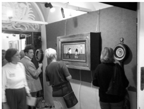
Figure 4: The setting for Deus Oculi in Chelsea Crafts Fair.

Deus Oculi was exhibited at the Chelsea International Crafts Fair; a major event for displaying contemporary arts and crafts. The exhibition space enabled us to display the piece on the whole of one wall, bounded by a door opening and a passageway (see Figure 4). Therefore, the piece could stand alone, independently of surrounding work. The location of the space, towards a restaurant, also guaranteed passing traffic as well as visitors actually looking carefully at the various pieces in the exhibition space.