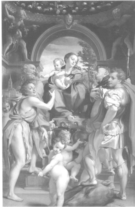
Figure1: Correggio: Madonna of Saint George (permission sought).

ate Baptist and St George, whilst simultaneously the Virgin, by the presence of the viewer, is encouraged to return the gaze of the spectator.