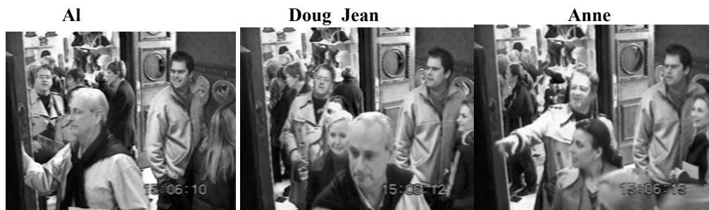
D: Ooh look, look look