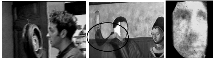
Figure 3: When someone looks at the hand-held mirror, their face appears in the central painting on the shoulders of one of the figures.

Deus Oculi was exhibited at the Chelsea International Crafts Fair; a major event for displaying contemporary arts and crafts. The exhibition space enabled us to display the piece on the whole of one wall, bounded by a door opening and a passageway (see Figure 4). Therefore, the piece could stand alone, independently of surrounding work. The location of the space, towards a restaurant, also guaranteed passing traffic as well as visitors actually looking carefully at the various pieces in the exhibition space.