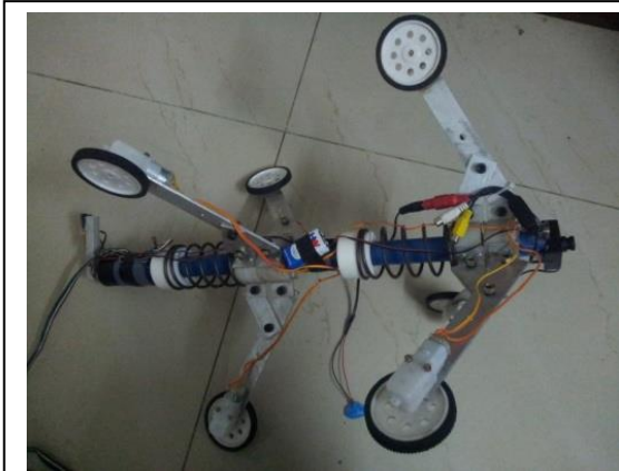
Front view of the robot