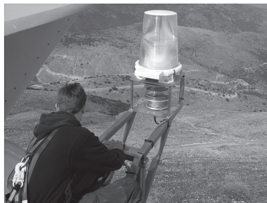
Figure 1. The W/T service technician at work.

to the manufactures time limits. The dispatcher needs to preserve an availability rate of 99.7% uptime (availability below 99.7% results in claims). The management of this trade-off dynamically determines a time-window where-in all maintenance activities have to be carried-out (e.g. arranging that each W/Ts' maintenance will be performed in less windy conditions, thus resulting to low energy yield).