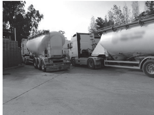
Figure 3. Cement silo trucks waiting to load.

As a rectification to the vehicle circulation problem, the company management was envisaging three measures: i) strict designation of silo truck routes