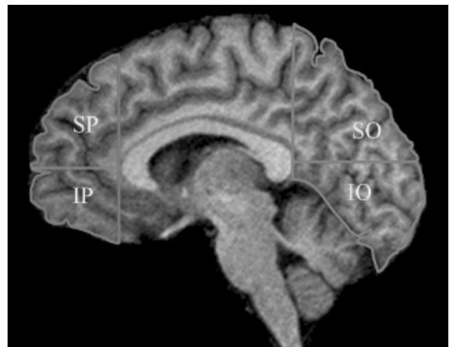
Figure 1. Regions of interest. IO = inferior occipital; IP = inferior prefrontal; SO = superior occipital; SP = superior prefrontal.

Seven regions of interest were measured in all participants, including total brain volume and total prefrontal, superior prefrontal, inferior prefrontal, total occipital, superior occipital, and inferior occipital regions (Figure 1). This method is similar to that used to measure postmortem brains 5 and in a recent MRI study. 25 Measurements of each region of interest were done in the sagittal plane using the Scion image program (personal computer version of NIH Image 33 ) in real space, with no warping of the images. A subset of five brains was measured by two researchers to establish interrater reliability through intraclass correlation ( SPSS , version 10.0, SPSS Inc , Chicago, IL). A reliability coefficient of .85 was considered acceptable. Interrater reliability was established for all seven regions of interest measured, and the intraclass correlation coefficient for any given region was at least .88.