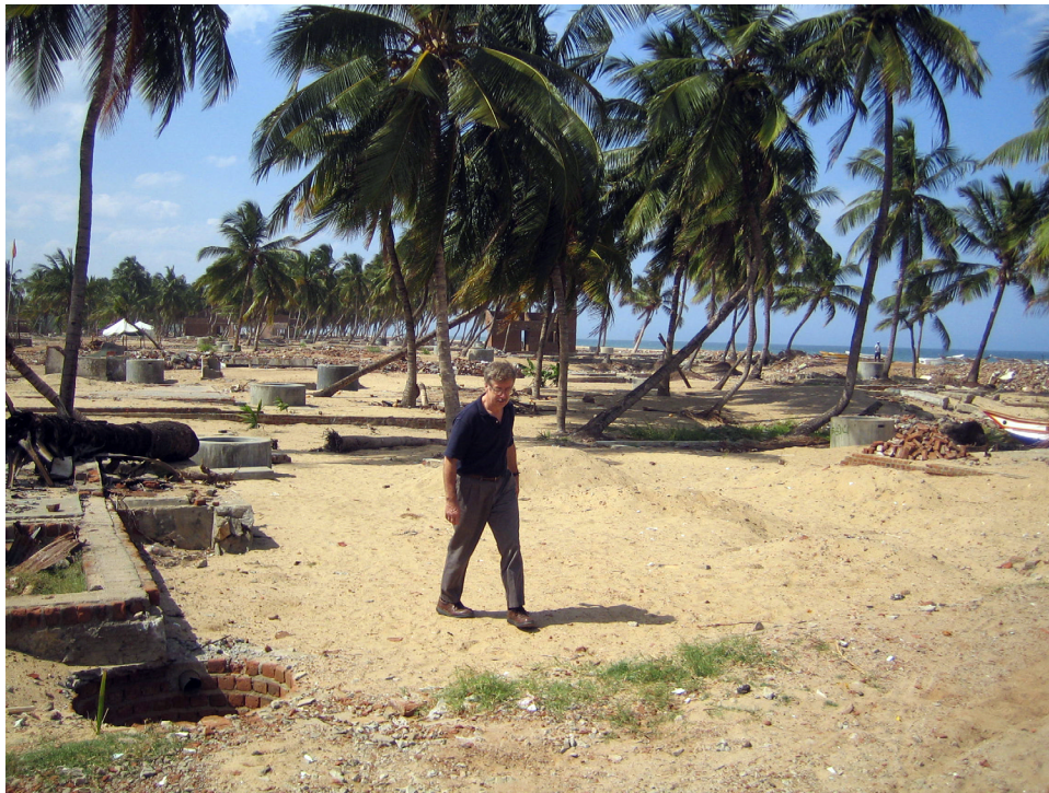
Figure 1. Photograph of the coastal area near Maruthumunai, Sri Lanka, showing the near complete destruction of homes along the coast. The photographer is standing about 150 m from the coastline, and it was reported to the team that the maximum wave height at this site reached high into the palm trees shown in the background. Note the high density of domestic open dug wells (typically short vertical circular structures), many of which were not destroyed by the wave but were inundated and flooded by seawater and debris.

tsunami event, (3) to investigate the medium and long-term impacts of the tsunami on coastal groundwater resources, (4) to develop a joint program to study the regional aquifer hydrology and hydrogeology of Sri Lanka, and (5) to transfer knowledge about coastal aquifer vulnerability to other south Asian nations.