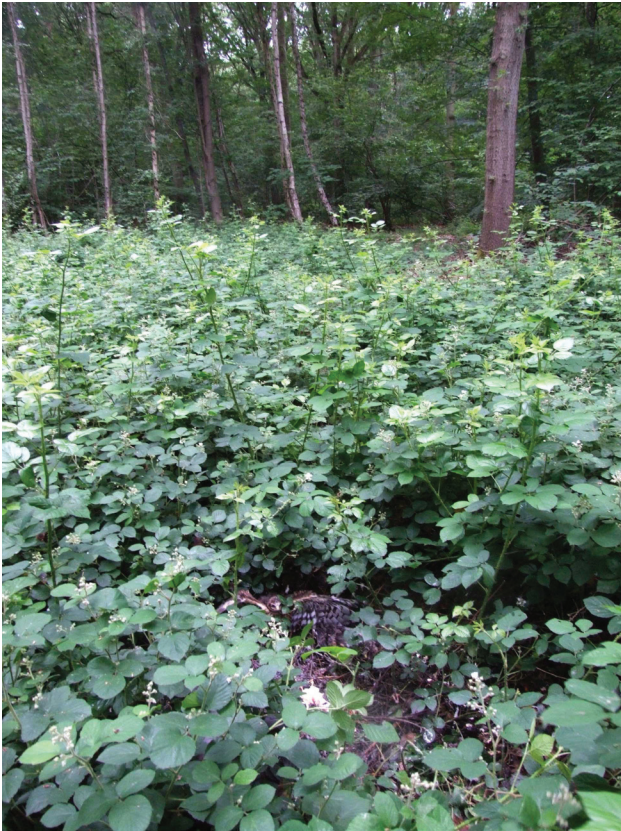
Fig. 2. – Overview picture of the 2010 Hen Harrier nest in a small deciduous forest patch. The nest is located in Bramble thickets amidst a clearing, with in front some hiding chicks.

17 % SE 1, urban: 14 % SE 1, other crops: 12 % SE 1, corn: 8 % SE 1, grasslands: 6 % SE 0, forest: 5 % SE 1; Fig. 3).