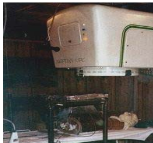
Figure 2. Application of fetal shield in treatment of anterior field (lateral view).

The effectiveness of the designed shield was evaluated by repeating PD measure-