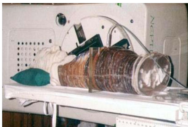
Figure 1. PD measurement set up for brain lateral fields in radiotherapy of the brain.

Fetal dose was estimated by taking PD measurements at selected points away from the field's inferior edge. Considering the location of fetus in different stages of pregnancy period, these values will reflect the range of dose throughout the fetus. In order to correlate the measurement points to the position of the fetus, a rate of 1 cm per week of pregnancy can be used for increase in the height of the fundus uteri with respect to the symphysis pubis (16, 17).