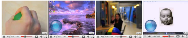
Figure 1. Workflow of DropBall.

DropBall is an explorative concept for fun and easy file transfer (see Figure 1). With DropBall users can transfer files by throwing a physical and familiar object: a stress ball. Colleagues are enabled to share digital files and links on this ball through an easy user interface. A squeeze in the ball triggers a desktop application to pop up, and while squeezing the ball the user can drag and drop files into the digital representation of the ball. Now the fun starts. Pick out a colleague you would like to share the information with, and throw the ball towards him/her. Once received, the colleague only needs to squeeze the ball to make the files appear on screen, and clear the data ready for next use.