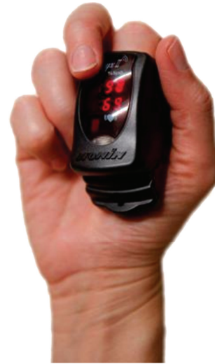
FIGURE 1: Application of the wireless Bluetooth pulse oximeter module (Onyx II 9560, Nonin Medical Inc., Plymouth, MN).

This study aimed to develop and verify the use of a remote pulse oximetry system on healthy individuals. Specifically, it aimed to establish the technical feasibility of transmitting pulse oximetry data remotely, to determine the validity of remote measurements when compared to conventional face to face measurements, and to evaluate the participants' perception on the usability of the technology.