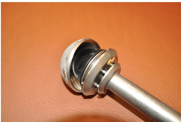
Fig. 2. Insertion handle attaches to inner rim that decreases functional articular surface.

Design issues of the acetabular component itself may have compromised results. The ASR XL acetabular component has less than a 180° hemisphere ranging from 148° to 160° depending on size. Not only does this