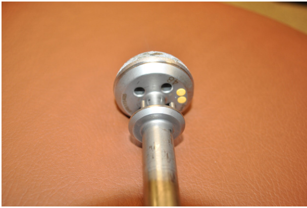
Fig. 1. Articular surface replacement acetabular component with insertion handle.

must be assumed. In addition, 15 patients were lost to follow-up. Because this was a retrospective study, no serum or urine ion measurements were prospectively made in this cohort of patients. Because we are reporting a consecutive series of patients, no learning curve period is accounted for. Possible technical errors with this system may have affected the results reported here. However, all surgeries were performed by high-volume fellowship-trained arthroplasty surgeons.