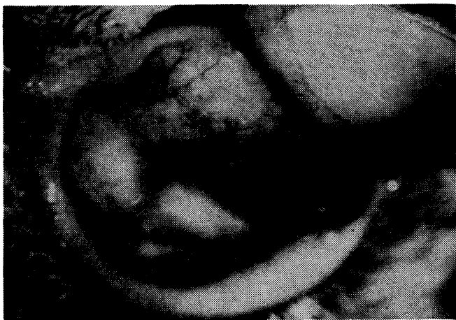
Fig. 1. Congestion and papillary hyperplasia of conjunctiva and third eyelid in a lamb after 2–4 weeks following scarification with strain of Chlamydia psittaci . Slit lamp, \times 3 .

Out of the three eyes inoculated with Bour strain, none showed true trachomatous follicles. However, mild to acute congestion was noticed during the period of observation. Control eye showed initial congestion only. Laboratory findings were negative except for serology in one animal where CF antibody titre 1:16 was recorded. The pre-test serum of this animal, however was negative. Both the animal strains after inoculation exhibited initial slight lid oedema, moderate to mild conjunctival congestion and trachoma-like follicles. In majority of the eyes conjunctival follicles were consistently seen between the period of 1–4 weeks involving both upper and lower conjunctiva including the third eyelid (Fig. 1).