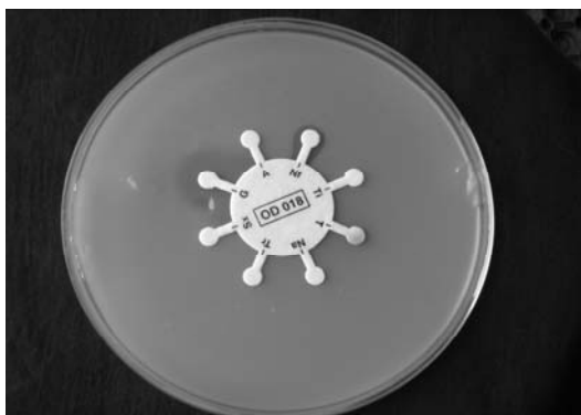
Figure 1. Antibiogram of E. coli isolate (E39) showing resistant to multiple antibiotics