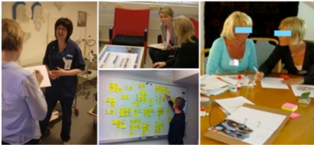
Figure 1 Different activities in the design research process