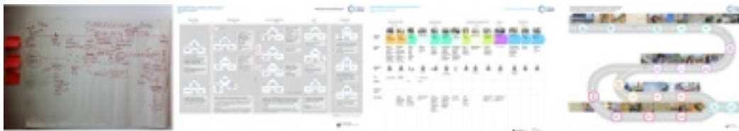
Figure 1 Visual iterations of the customer journey

The end result of the method iterations for the interviews, a board game, consists of a visual game board printed on A2 cardboard paper, three 3 cm high wooden pawns and three 3 cm diameter wooden chips. The game board visualizes the customer journey in a simplified form, showing the main touchpoints on a winding journey through the board and pictures taken of people, surroundings and artifacts.