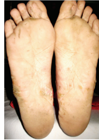
FIGURE 3: Scaly, crusted plaque involving both feet.