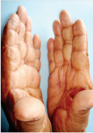
FIGURE 1: Multiple tiny vesicles involving lateral aspect of fingers.