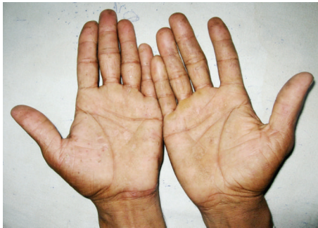
FIGURE 2: Multiple vesicles symmetrically distributed over both palms.

industrial areas [6]. Altered Zinc/Cadmium ratios have been found in industrial workers and also in certain disorders like prostate cancer [7], decreased renal function [8], hypertension, and coronary artery disease as various toxic and trace metals can interact by influencing each other's absorption, retention, distribution, and bioavailability in the body. Toxicity of Cadmium has been found to be dependent on disturbance in Zinc metabolism, earning the name of "antimetabolite" of Zinc [7]. Thus, there is a need to estimate the levels of serum Zinc and Cadmium in patients with chronic vesiculobullous hand dermatitis.