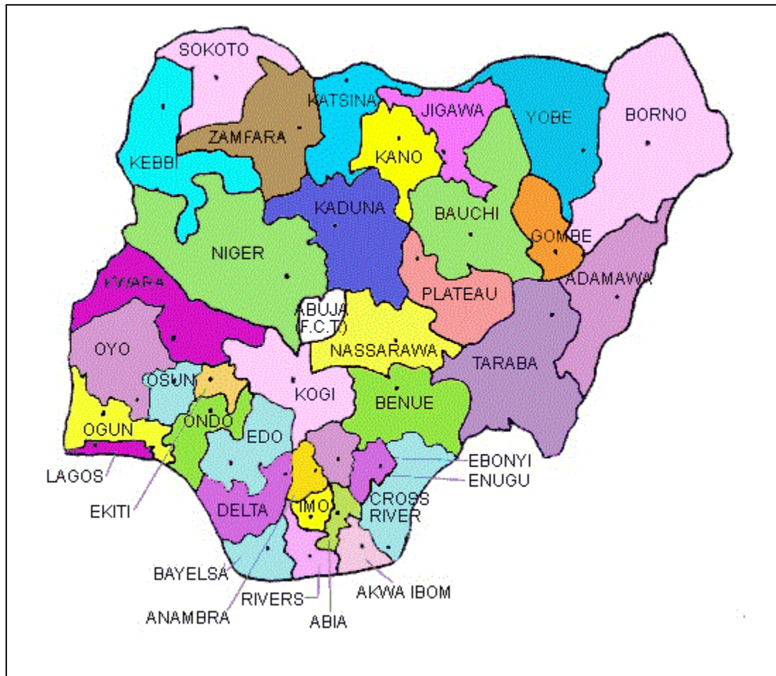
Fig. 1 MAP OF NIGERIA

According to Adegeye and Dittoh (1985) credit is needed to break the poverty circle among the farmers since low income implies high portion of low productivity, which will still result in lower income. On the other hand, Awoniyi (1991) noted that if the small-scale farmer is to grow to become medium and eventually large scale-farmer, he must be having among other things an assured supply of credit for short-term, medium and long-term respectively.