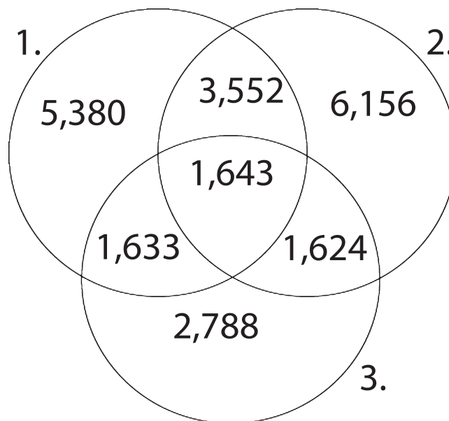
Figure 1. Overlapping ascertainment of the groups used in the study. 1. Labeled as gout. 2. Allopurinol prescription. 3. Colchicine prescription.

The prevalence was about 5 times higher in men compared to women (Table 1). The prevalence of gout was lowest in current smokers, followed by nonsmokers and then ex-smokers. There was no clear trend in an association of gout prevalence by SES, with quintile 4 being elevated compared to the other quintiles but then quintile 5 being reduced. The estimated prevalence by age increased with very low numbers having gout in their 20s and increasing substantially in the elderly (Figure 2, and Supplementary Table 2, available online at jrheum.org). The prevalence rate increased steadily from 0.20% (95% CI 0.17–0.24%) in men aged 25–29 years to over 11.05% (95% CI 10.53–11.57%) in men older than 85 years. Women also showed a rising prevalence with age but the rates in premenopausal women were