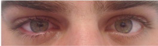
FIGURE 2: Patient's photo with round and regular pupil of both eyes one day after CXL treatment of the right eye.

On the first postoperative day, slit-lamp examination of the treated eye revealed a regular, round, and reactive pupil (Figure 2); cornea showed slight edema and epithelial defect. On the fourth postoperative day, corneal epithelium was completely healed and the contact lens was removed.