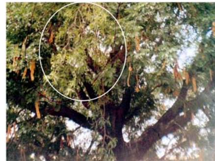
Fig. 1: Globimetulla brownie parasitizing on eukalyptus in front of ABU bookshop

The results obtained indicated the presence of tannins, alkaloids, flavonoids, carbohydrates in both the aqueous and ethanolic extracts. Terpenoids, lipids and saponins were absent. The results of the antimicrobial activities are presented in Table 2. From the results in Table 2, none of the extracts inhibited Staphylococcus