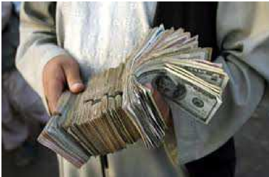
Corruption in Afghanistan by distribution of money