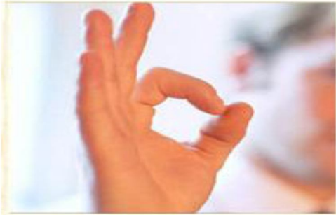
Fig. 1 Vision based

besides system requirements such as velocity, recognition time, robustness, and computational efficiency [7] [17].