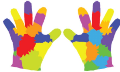
Fig. 3 Color Makers

Marked gloves or colored markers are gloves that worn by the human hand [5] with some colors to direct the process of tracking the hand and locating the palm and fingers [5], which provide the ability to extract geometric features necessary to form hand shape [5]. The color glove shape might consist of small regions with different colors or as applied in [23] where three different colors are used to represent the fingers and palms, where a wool glove was used. The amenity of this technology is its simplicity in use, and cost low price comparing with instrumented data glove [23]. However this technology still limits the naturalness level for human computer interaction to interact with the computer [5].