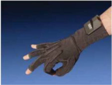
Fig. 2 Data Glove

Instrumented data glove approaches use sensor devices for capturing hand position, and motion. These approaches can easily provide exact coordinates of palm and finger's location and orientation, and hand configurations [17] [21] [22], however these approaches require the user to be connected with the computer physically [22] which obstacle the ease of interaction between users and computers, besides the price of these devices are quite expensive [22], it is inefficient for working in virtual reality [22].