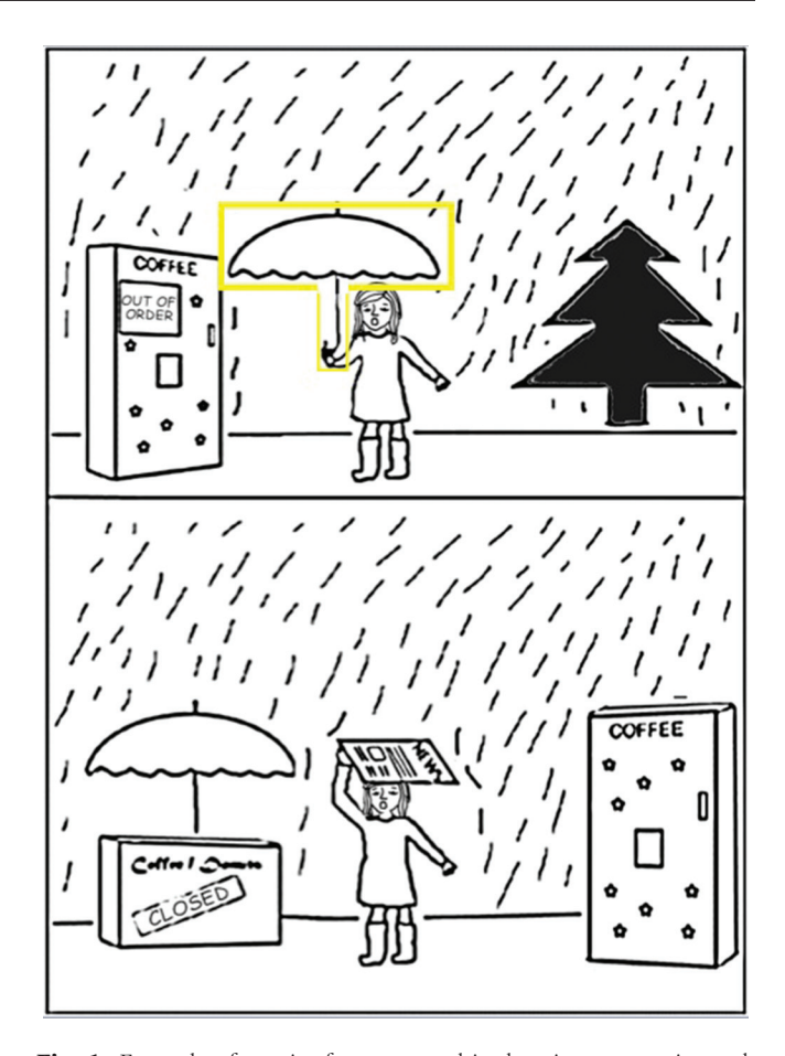
Fig. 1. Example of a pair of scenes used in the picture-mapping task (adapted from Markman & Gentner, 1993, and Tohill & Holyoak, 2000). Participants were shown both scenes at the same time. After 10 s, one of the objects in the top scene was highlighted (here, the umbrella), and participants had to indicate which object in the bottom scene "goes with" the highlighted object in the top scene. For each pair of scenes, the bottom picture included both a potential featural match (here, the umbrella over the coffee stand) and a potential relational match (here, the newspaper the woman is holding over her head, which performs a function similar to the umbrella's in the top scene).

Procedure. Each trial began with a 500-ms fixation cross, followed by presentation of the A : B and C : D pairs. The A : B pair appeared on the computer monitor above the C : D pair. Participants were instructed to press a key with their right index finger if the analogy was valid and to hit a different key with the left index finger if the analogy was invalid. They were told to solve each trial as quickly and accurately as possible. Feedback was provided if the participant made the wrong decision or if 8 s