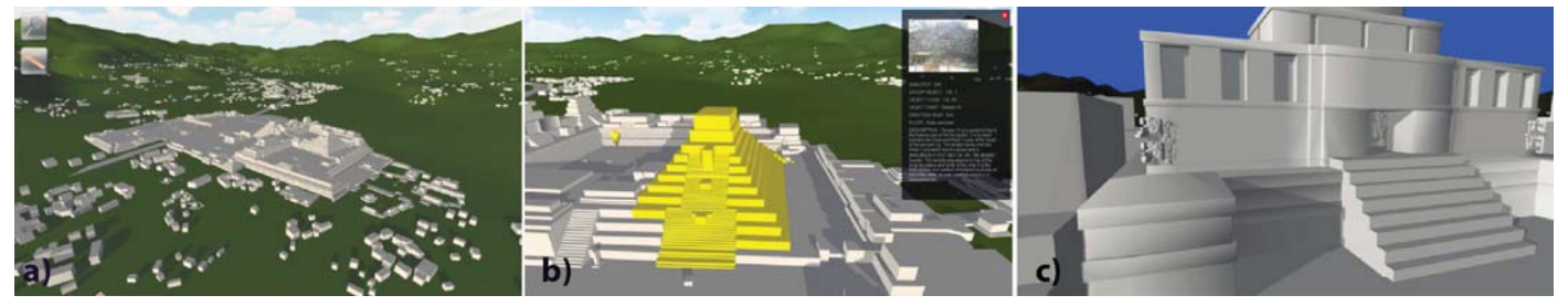
Figure 2. Example views of the QueryArch3D tool: a) aerial view with LoD1 models b), LoD-dependent queries on geometric models ) and c) LoD3 with interior walls/rooms and some simplified reality-based 3D elements.

To satisfy these needs, the tool has two main components: (1) data modeling and storage in a DBMS and (2) visualization. The DBMS uses PostgreSQL with the PostGIS extension to reduce data heterogeneity and allow storage of both non-spatial and spatial data.