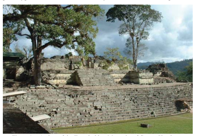
Figure 1. A view of the Temple 22 at Maya site of Copan, Honduras.

In 2009, the MayaArch3D project was founded to explore the possibilities of 3D digital tools and Geographic Information Systems (GIS) for archaeological and art historical research on ancient Maya architecture and landscapes. Bridging the humanistic and scientific disciplines, the project brings together art historians and archaeologists with computer scientists and specialists in Geomatics. As a case study, the project selected the ancient Maya city of Copan, Honduras today, a UNESCO World Heritage Site (Fig. 1). The major research goal of the project is to understand how built forms and natural landscape features communicated information and structured social experience during the reigns of Copan's 13th and 16th rulers (AD 695-820). Towards this end, traditional fieldwork methods coupled with digital 3D recording and modeling tools are being used to collect, analyze and assist in the interpretation of archaeological data [22, 23, 24, 25]. In order to visualize and query heterogeneous information, a prototype 3D WebGIS tool, QueryArch3D, was developed.