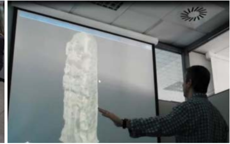
Figure 4. Set-up of the touchless interaction platform to control the 3D environment and allow immersive and collaborative system for heritage applications.

limitations of 2D media (e.g., lack of multi-scalar and multi-perspective analysis). Using spatial databases to overlay and link datasets, a GIS helps people to interact with and understand data and to reveal complex relationships, patterns and trends that are not evident when using traditional, or non-spatial, databases that are dependent on 2D media [30, 31]. 3D models placed in a VR landscape can provide a sense of spatial awareness and embodiment that can help users to learn about indigenous spatial concepts and the organization or use of spaces in ancient cultures [8, 9, 32].