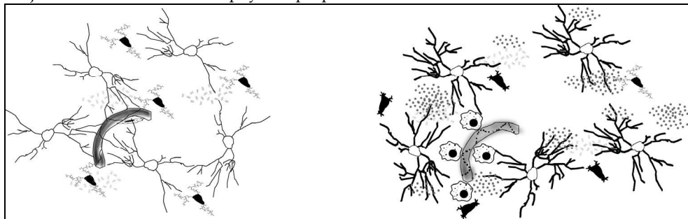
Fig. 2. Schematic of role of astrocytes in pathogenesis. Normal astrocytes (at left) have foot processes ensheathing over 60% of the endothelium and express low levels of GFAP and cytokines / chemokines. In encephalitis, there can a loss of connection to the endothelial cells, increased cytokine / chemokine secretion and altered expression of intermediate filaments, including GFAP and peripherin (right).

of eotaxin (Cardona et al., 2003), reinforcing the brain's immune-privileged status in conjunction with the selective physical properties of the BBB.