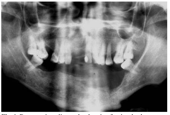
Fig. 1. Panoramic radiography showing foreign-body granuloma extending from the central incisive to the first molar.

Subsequent to the biopsy, the intensity of the pain was reduced. After explaining to the patient that the foreignbody granuloma occurred due to his traumatic accident, he became reluctant and declined the treatment. Being aware that the lesion was not a malignant tumour the patient refused to receive further surgery, even though some fragments still remained in the mandible bone tissue. Since then, he has been followed every 6 months. In a recent panoramic radiography it was observed that lesion aspects remain unaltered.