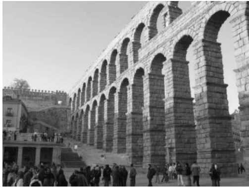
Figure 1 Roman aqueduct in Segovia, Spain

Ad Lucilium epistulae morales . 86). Baths were probably also beneficial for public health in towns where there was an abundance and rapid turnover of water. However, in towns where water was in short supply, cisterns had to be used and the turnover of water was slow, the role of baths was probably negative for public health.