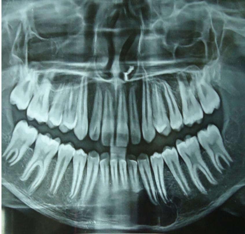
Figure 1: Pre- operative panoramic view showing a well defined unilocular radiolucency in the anterior of mandible extending from right lateral incisor to left first premolar and extending to the lower border, with well-defined, smooth, corticated margins with no bony expansion.