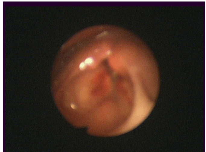
Figure 2: Haematoma involving left arytenoid and false cords with limited view of the glottis.

clinical improvement. He was observed for four days in hospital (the first 24 hours on HDU) and on discharge, the patient felt he had returned to his pre-morbid state. He was discharged on a low dose of oral prednisolone for one week.