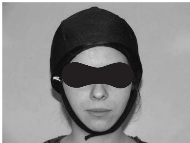
Figure 1. The picture of cap used in the study.

Cold therapy was administered to the patients by gel cap (Fig. 1) during both migraine attacks. The cap was stored in a freezer. At the onset of the migraine attacks, patients wore the cap and used it for 25 min. We choose 25 min as the time for application of the gel cap based on the results of two published studies (1,6). Headache severity was measured by VAS (0: no pain to 10: severe pain) and pain relief was measured on a