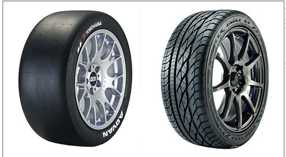
Fig. 2. Smooth tires such as the racing tire (left) provide the best grip in dry conditions. In wet conditions, however, rain treads (right) are better. Here, we explore the hypothesis that, although smooth fingertips provide the best grip in dry conditions, fingertips wrinkle in wet conditions for better grip, akin to rain treads.