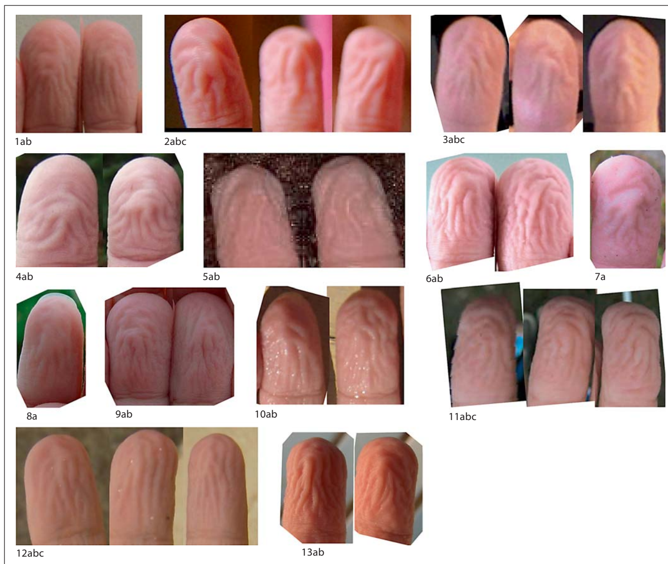
Fig. 4. Wet-wrinkle networks on 28 fingers from 13 hands. These were found in the public online domain and were kept so long as the image was sufficiently sharp to see the wrinkles.

response. Wilder-Smith [2004] provides evidence that the finger-wrinkling mechanism may be due to digit pulp vasoconstriction: wet-induced wrinkles are accompanied by vasoconstriction [Wilder-Smith and Chow, 2003a], and wrinkles are induced by vasoconstrictive agents [Wilder-Smith and Chow, 2003b; Wilder-Smith, 2004].