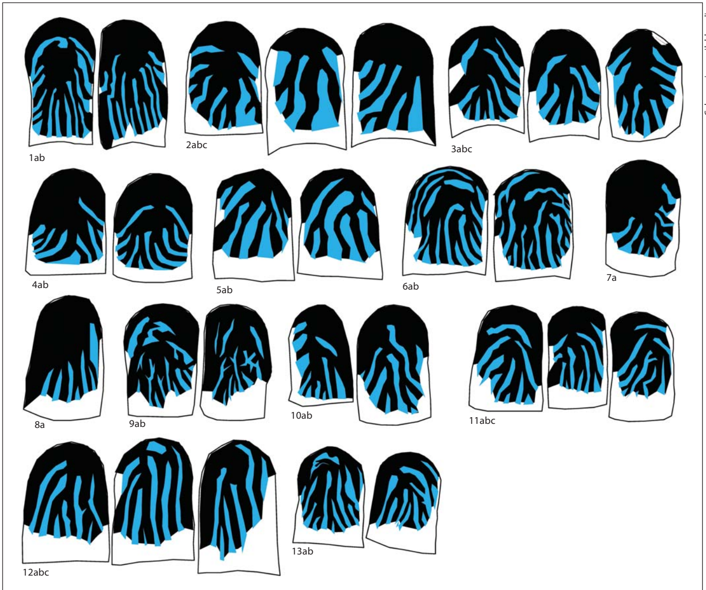
Fig. 5. Channel-like troughs in finger wrinkles (light blue; color refers to online version only), and the borders between them (black), for the fingers in figure 4. The signature of a drainage network on a convex promontory (see fig. 3b, d) is readily apparent; disconnected channels diverge from one another away from the peak, and divides form a connected tree with its root at the peak.

another uphill. However, drainage networks are dramatically different in topographies such as convex promontories, where roughly the ‘opposite’ is found: the channels are disconnected from one another and diverge away from one another downhill, and divides link together to form a tree with its trunk at the promontory’s peak (fig. 3b).