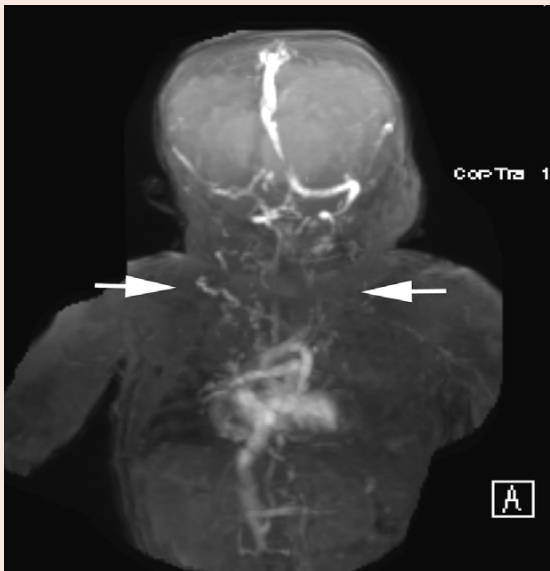
Figure 3: A magnetic resonance venogram of the head, neck and chest showing the cardiac chambers, aortic arch and origin of the brachiocephalic artery using the Maximum Intensity Projection (MIP) technique, but paucity of normal venous structures above this level (arrows). Numerous collateral veins are seen in the area instead.