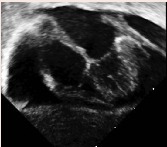
Figure 2: A 2-Dechocardiogram displaying a large pericardial effusion.