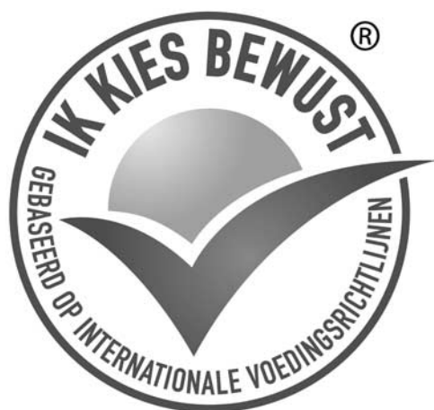
Fig. 1 The Ik Kies Bewust ('Choices') nutrition logo