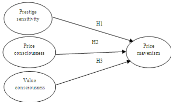
Fig. 1: Conceptual model

Babin and James (2010) build on this approach and propose a multidimensional representation of value capturing the relative and subjective worth of consumer shopping activities. The personal shopping value scale captures value parsimoniously with two dimensions: utilitarian value and hedonic value.