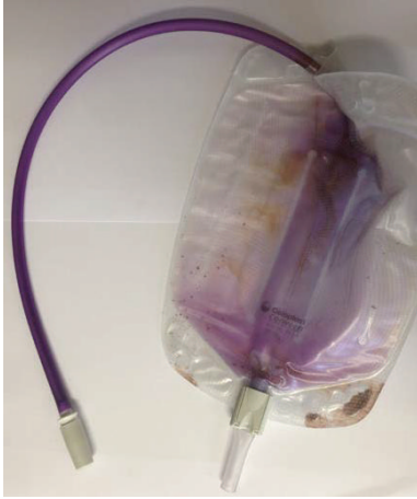
FIGURE 1: Purple discoloration of urine bag and tubing coming from suprapubic catheter. Note that the nephrostomy urine bag (not shown) had a normal color.