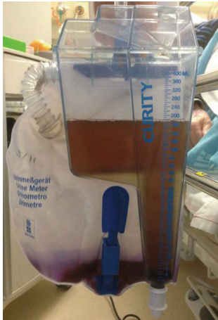
FIGURE 2: Purple color of the urine bag. Note that the color of the urine in the collection device before entering the bag is normal.

at admission, before the nephrostomy procedure, had been 6.36 mg/dL). Hemogram showed a mild normochromic normocytic anemia with hemoglobin of 10.5 g/dL; white blood cell differential count and platelets were normal. Liver function tests were within normal limits. Lactate dehydrogenase was elevated (505 U/L): this was attributed to the diffuse large B-cell lymphoma. The level of CRP was 25 mg/L (reference value < 5 mg/L). Analysis of the suprapubic catheter urine showed pyuria and trace hematuria. Urinary pH was 9.0. Urine culture came back positive for Pseudomonas aeruginosa and Enterococcus faecalis . Analysis of the nephrostomy catheter urine showed trace hematuria, with a pH of 6.0 and a negative culture. As the nephrostomy urine was sterile and the patient had no signs of urinary infection, no antibiotics were given. The purple discoloration gradually disappeared during the following week. At discharge, kidney function had improved back to baseline with creatinine of 1.20 mg/dL. The patient was subsequently treated with R-CVP chemotherapy, with remission after 6 cycles.