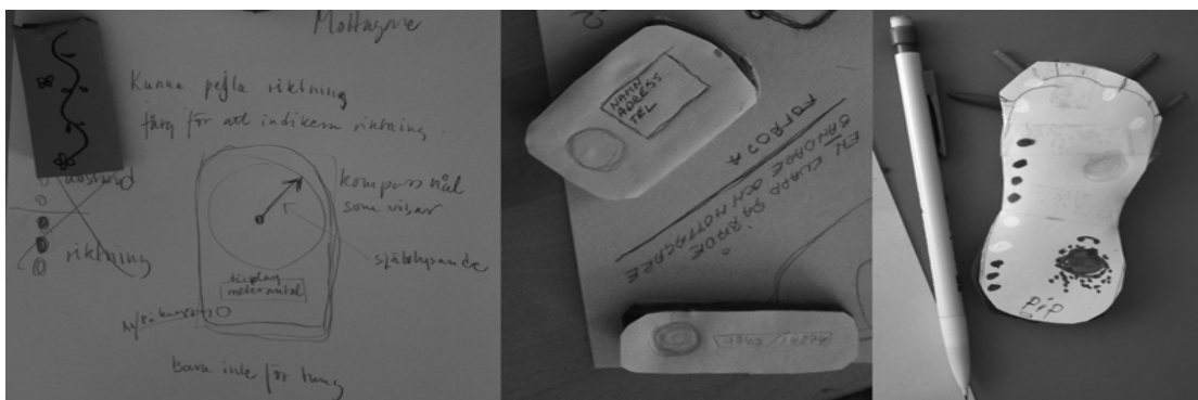
Fig 3. Left: a paper prototype of the receiver and the sender as inside a piece of jewellery. Middle the sender with a nametag and a button. Right a receiver made of paper, flower foam brick and flower sticks.

The fourth and last brokering situation had the main objective to build and design a low-fi prototype (Fig 3). At the workshop the NOKD had to their help: paper, pencils with different colours, flower foam bricks, scissors, sticky tape, post-it notes and scalpels. The instructions was just: "lets get creative in the designing of a low-fi prototype". Before the workshop HLL and ICTD had a discussion about "How will the workshop go?", "How will the NOKD react to this workshop?", "Will they be engaged?". Most of the NOKD's members were over 65 years. When the workshop started they really started to work, there was absolutely no reason for our earlier concerns. They discussed different solutions, draw sketches and used the scalpel in cutting the flower foam brick and laughed a lot. After about 90 minutes they presented their low-fi prototypes of the sender and receiver. A loud discussion started during the presentation of their different ideas and the ICTD had a lot of questions. One of the groups presented a receiver inspired from a compass which should show the indication of direction (Fig 3). The sender would be inside a piece of jewellery and there were mainly two reasons behind this solution: the demented should want to wear the sender and for a demented person routines are important and it is easier to learn a new routine if the demented wants' to wear the sender.