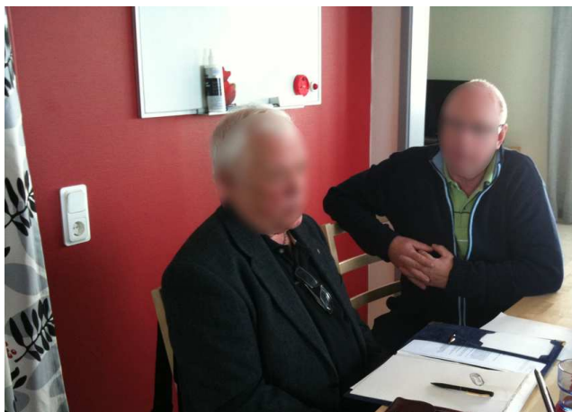
Figure 2: The apartment

The workshops in the TFP were held in an apartment that has been a meeting place for next of kin's to demented and also demented people. The apartment is equipped with tools and artefacts especially designed for demented elderly people. The apartment also serves the purpose as a kind of test laboratory for NOKD where they can try, test and also borrow (for a shorter period) different tools and artefacts.