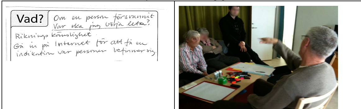
Figure 3a and 3b A scenario note and a brokering situation (notes in Swedish)

At the first workshop the researchers from HLL had introduced scenarios as a technique for capturing ideas and needs for the ICT product and the ICTD demonstrated their product. The brokering situation took place when the NOKD were working with the scenarios. They discussed quite loud and wrote down a question (Fig 3a): “If a demented person disappear, were will I start to look?” They also wrote down a note (Fig 3a): “Direction indication! Use the internet to get an indication where the person is.” They also underlined some of the statements that they had written on the paper.