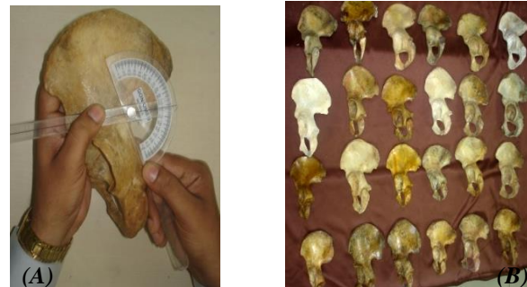
Figure 1: (A) Showing the Measurement of Angle between PIIS-IS using Protractor (B) Hip Bone Samples.

using the Statistical Package for the Social Sciences (SPSS). The graph was drawn using Microsoft Excel (Table 1).