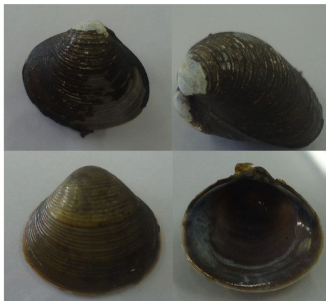
Figure 3. Record of Corbicula largillierti , reservoir Epitácio Pessoa, Paraíba River basin, Brazil.

The introduction of the mollusk in the study reservoir may have happened due to a variety of reasons. Given the higher densities near entry points of tributary streams into the reservoir, we believe that the mollusk was carried into the reservoir from these affluent tributaries. An alternative is that Corbicula largillierti may have been brought along with exotic molluscivorous fish that have been introduced into the reservoir (Gurgel & Fernando 1994). It is known that some species of