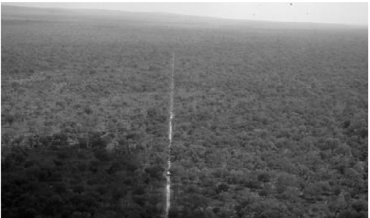
Aerial view of one of the many seismic cut lines.