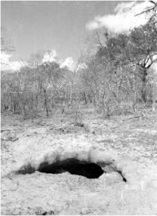
A shallow dry-season waterhole in the bed of the Nahomba River near its headwaters.

serves further investigation in light of the importance of these thickets for rhinos.