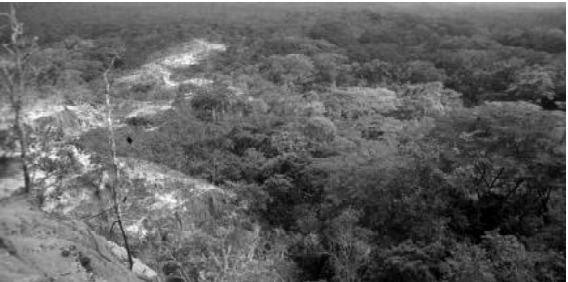
One of the many eroded ridgetops in the Naluale area.