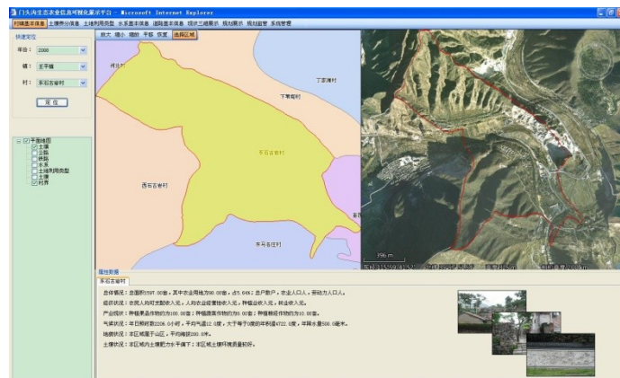
Fig. 3. Query result of administrative village

The system provides two query methods: query map by attribute and query attribute by map. As shown in Fig.3, based on the year, names of town and administrative village selected by the user, the system shows relevant positional information. When the user clicks on the map, the system will show information from the attribute database, such as area, numbers of households, agricultural population, income, climate, fertility of soil, etc.