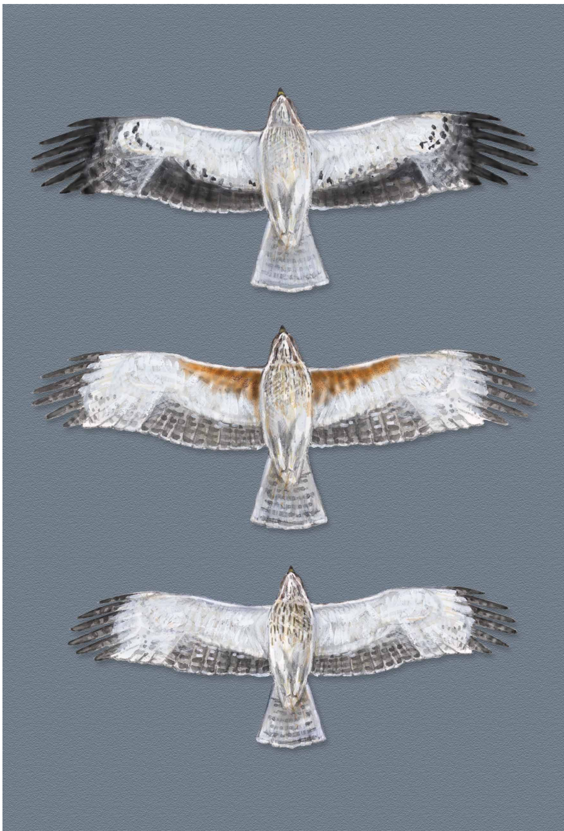
FIGURE 3. Underside pattern of pale morph Aquila pennata (upper), A. morphnoides (middle) and A. weiskei (lower). Drawn from photos and field sketches.