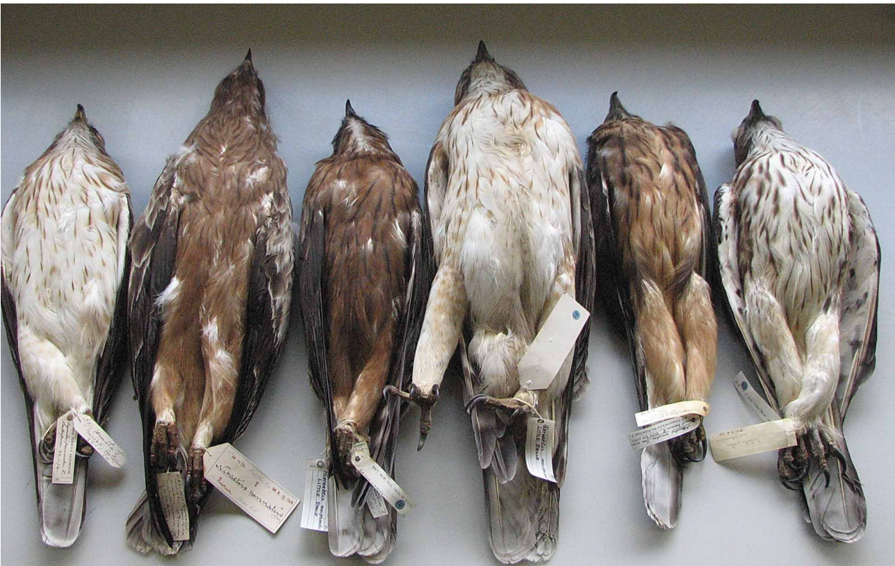
FIGURE 2. BMNH specimens in dorsal and ventral view. From left to right, pale-morph male and dark-morph female Aquila pennata , dark-morph male and light-morph female A. morphnoides , and dark-morph and pale-morph female A. weiskei .