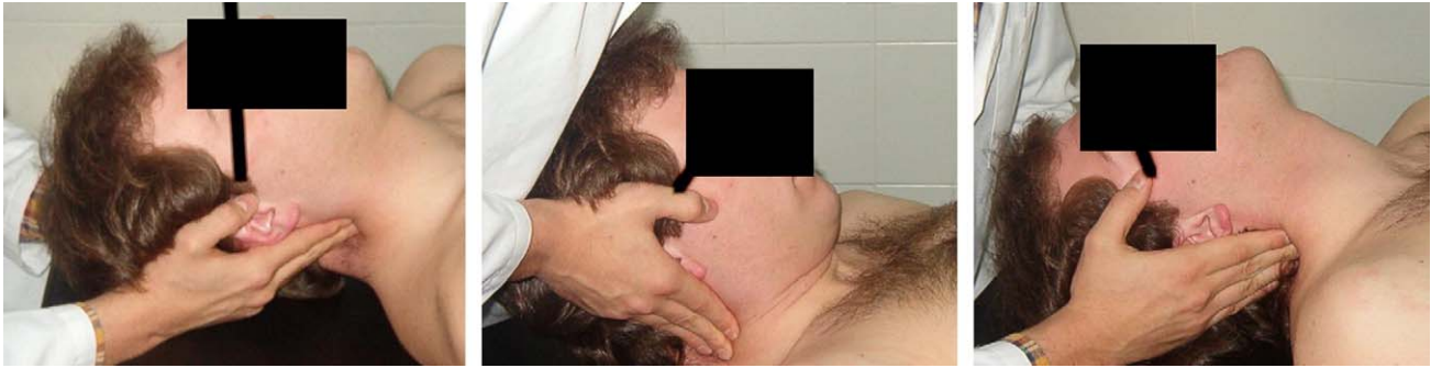
Fig. 1. Lateral gliding test for the cervical spine.

spine using functional radiographs to measure intervertebral motion at a hypomobile segment, which was 3.4 mm less than the contralateral side. 18 Based on our previous study, the lateral gliding test for the cervical spine is as valid as a radiological assessment of intervertebral dysfunctions in the mid and lower cervical spine. 18