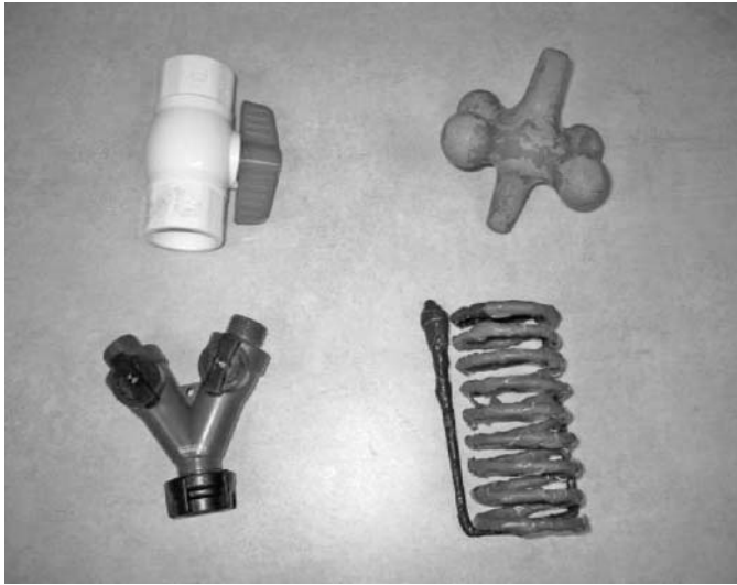
FIGURE 1. Novel toys used in the present study (adapted from D. Mumme & A. Fernald, 2003).

In the first trial, all children saw the peer display attention and simple interest toward one of the two toys. In the second trial, half the children saw the peer display positive emotion (happiness) toward one of the two toys, and the other half saw the peer display negative affect (fear). The peer directed attention and emotion to only one of the two toys on each trial (the target toy), with sides counterbalanced over the neutral and emotion trials. The other toy was unattended (the distracter toy). Each toy in a pair was the target toy for half of the infants, and the distracter toy for the other half. A different pair of toys was presented in each trial: the rubber jack was paired with the letter holder, accompanied by neutral affect; the hose adapter was paired with the plastic tube, accompanied by either positive or negative affect. For half of the infants, the peer's positive or negative emotion was directed to the toy on the child's right, and for the other half the peer's emotion was directed to the toy on the child's left.