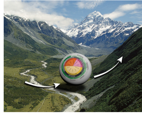
FIGURE 2: The Behavior Change Ball moving through a landscape. The proposed relationships between the theoretical concepts from the Behavior Change Ball are best illustrated by the metaphor of a ball moving through a landscape [49].

The framework is developed to capture and understand organizational behaviors (OBs) of local policy makers at strategic, tactical, and operational levels that are essential for integrated policy. Ten OBs are specified and related to capability, opportunity, and motivation (COM) and nine intervention functions and seven policy categories are formulated (Figure 1). Although the BCB framework in itself does not explain or predict OBs, it aims to capture obstacles that can explain variation in policy development. Therefore, the BCB was considered the most appropriate framework for the current study.