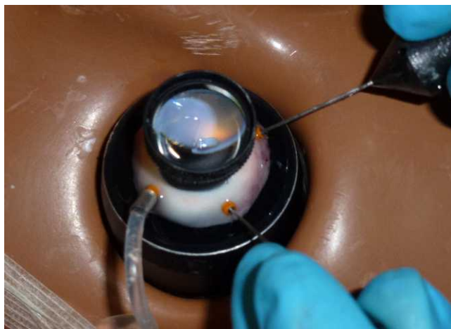
FIGURE 1. A 23-gauge vitrectomy performed in cadaveric pig eyes. Vitreous cutter and illumination probe are introduced through superior cannulas, placed 4 mm from the limbus.

vitrectomy have any influence on the degree of incisional vitreous incarceration, so a fixed pressure value was used. The pressure value was determined as that appropriate for performing vitrectomy in the pig eye. Vitrectomy was also performed inside both superior cannulas, and all around the vitreous cavity next to the inner tip of the cannula; we also reached each perisclerotomy area by inserting the vitreotome probe through the opposite superior cannula. After checking that balanced salt solution (BSS) flowed freely through both superior cannulas, the infusion line was clamped and 1 mL of triamcinolone acetonide 40 mg/mL (TrigonDepot, Bristol-Myers Squibb Company, Princeton, NJ) was slowly injected through the cannula used by the vitreous cutter, with the aim of staining intraocular residual vitreous. The infusion line was opened and all the free triamcinolone that was not adhered to residual vitreous was exchanged for BSS.