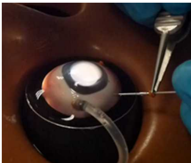
FIGURE 2. Superior cannula removed over the light probe.

After that, infusion pressure was lowered to 5 mm Hg and the superior cannulas were extracted following their oblique incisional pathways. In 59 randomly chosen eyes, the cannula used by the vitreous cutter during the vitrectomy was removed with the light pipe introduced through it (Fig. 2), and the cannula used by the illumination probe was taken out with the cannula plug inserted. In the other 59 eyes, the cannula used by the illumination probe during the vitrectomy